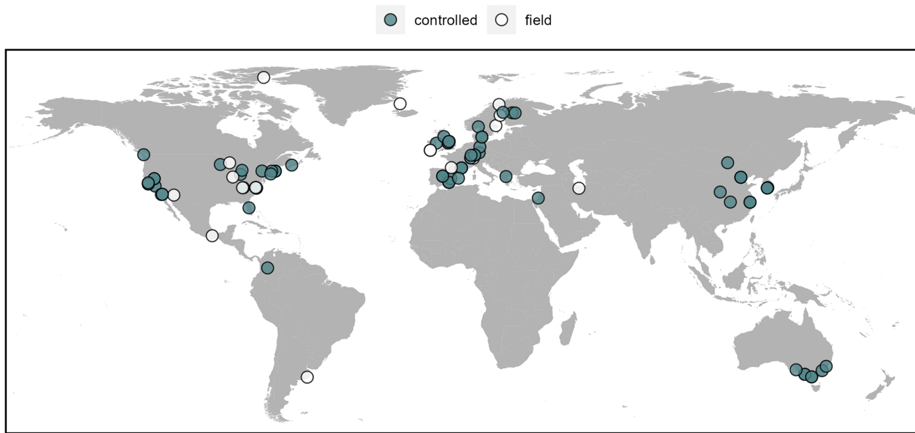
Figure 1. Map showing the location of the 96 studies included in this meta-analysis. Blue and white dots represent studies performed under controlled (i.e. greenhouse or laboratory) and field conditions, respectively.

more than one study case in a given study took place when more than one response was measured and/or more than one abiotic treatment was tested (against a control), in which case the number of study cases in a given study equaled the number of responses by the number of treatment level versus control comparisons. We used different approaches to account for both sources of non-independence in our analyses and assessed the robustness of our conclusions to the inclusion of multiple study cases per primary study.